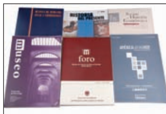
Some journals distribute by Marcial Pons