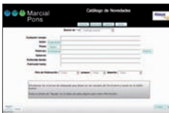
Search engine of the Marcial Pons' Marc service http://marcialpons.abysnet.com