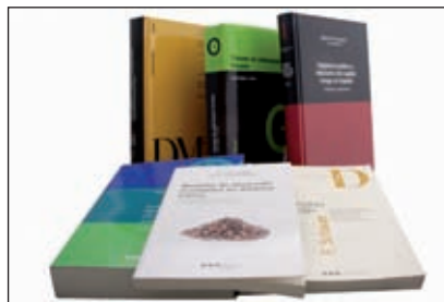
some colecciones published by Marcial Pons Ediciones Jurídicas y Sociales