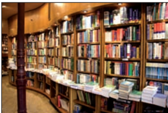
Marcial Pons. Books in economics and Business Plaza de las Salesas, 10. Madrid