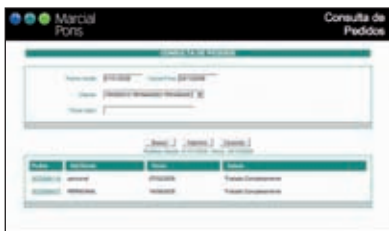
Order tracking through the Extranet