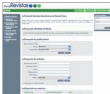
Online journal platform http://revistas.marcialpons.es

Marcial Pons have aimed to go one step further in disseminating journals and periodicals, thus, it has launched an Online Journal Portal, making their content available online to professionals in a simple and practical manner. Mainly Spanish and Latin-American periodicals on the subjects we work with will be posted regularly.