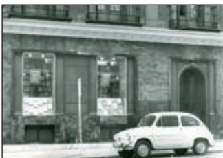
Marcial Pons Law Books Madrid, 1970

In order to meet its growing logistic needs, in 1995 Marcial Pons based its central offices and warehouses in its own 2.500 m2 building for the exclusive use of the companies of the Group, in which their logistic and support departments as well as the headquarters of the publishing companies, the distributor and the subscription agency are based.