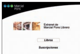
Marcial Pons' Extranet http://clientes.marcialpons.es