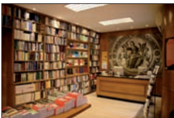
Marcial Pons. Law Books Bárbara de Braganza, 8. Madrid