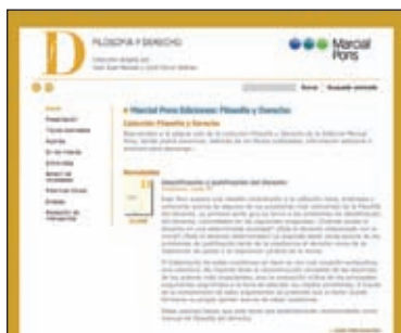
The law and philosophy collection's web site http://www.filosofiyderecho.es