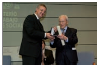
"Gold Metal for Excellence in Labour award ceremony October, 18 th 2005