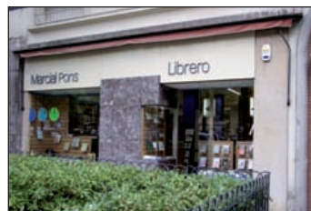
Marcial Pons. Humanities Plaza del Conde del Valle Suchil, 8. Madrid