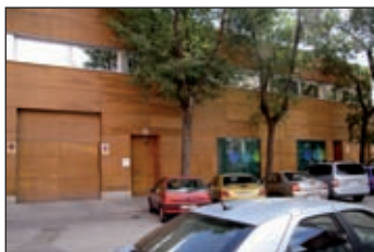
Marcial Pons. Headquaters San Sotero, 6. Madrid

Marcial Pons has 55 years of experience in the foreign book market. Currently, it maintains commercial relationships with the most important publishing houses in Europe and America. These are well-established relationships which enables Marcial Pons to function as a bridge