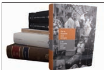
Some books distribute by Marcial Pons