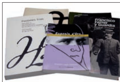
Some collections published by Marcial Pons Historia

Aiming at disseminating the Latin-American legal culture in such continent and worldwide, in 2007 the group once more founded a new publishing house “ Marcial Pons Argentina ” located in Buenos Aires.