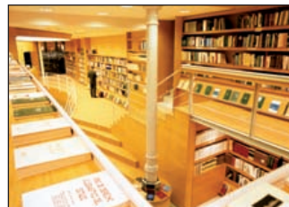
Marcial Pons Llibreters. Books in Law, economics and Business Provença, 249-251. Barcelona