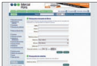
The marcial Pons' website advanced search engine