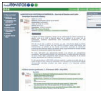
Journal card in the Marcial Pons online journal platform